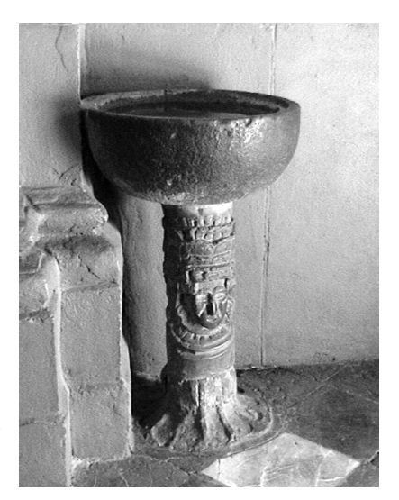
Picture 2: Stoup with the Tlaxcalan god Camaxtli as column. San José de Tlaxcala.

This problem of nepantlism was frequently solved by veiling of forbidden Nahua concepts or elements with a Spanish or Christian surface<sup>39</sup>. The Franciscans construed this as an unacceptable syncretism that falsified their idea of a primitive and pure Church that they wanted to establish in New Spain.